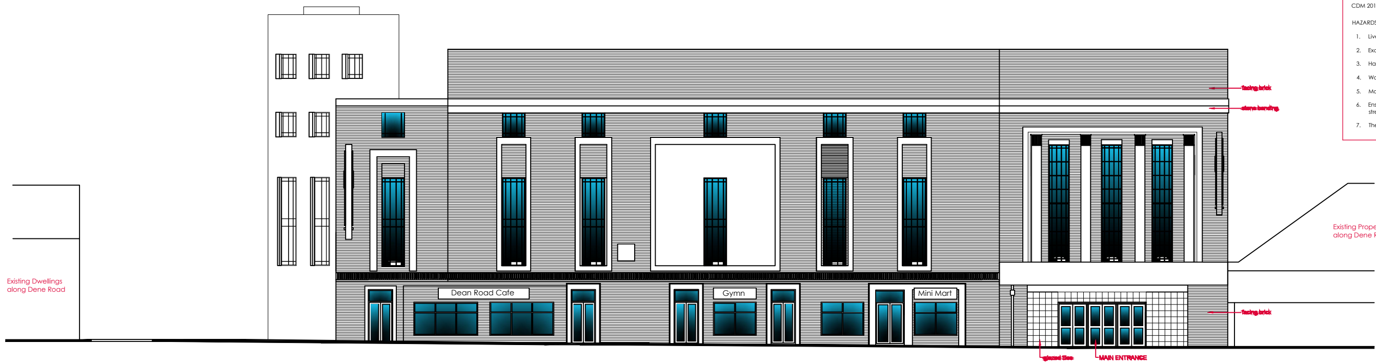
PROPOSED SOUTH ELEVATION - DEAN ROAD